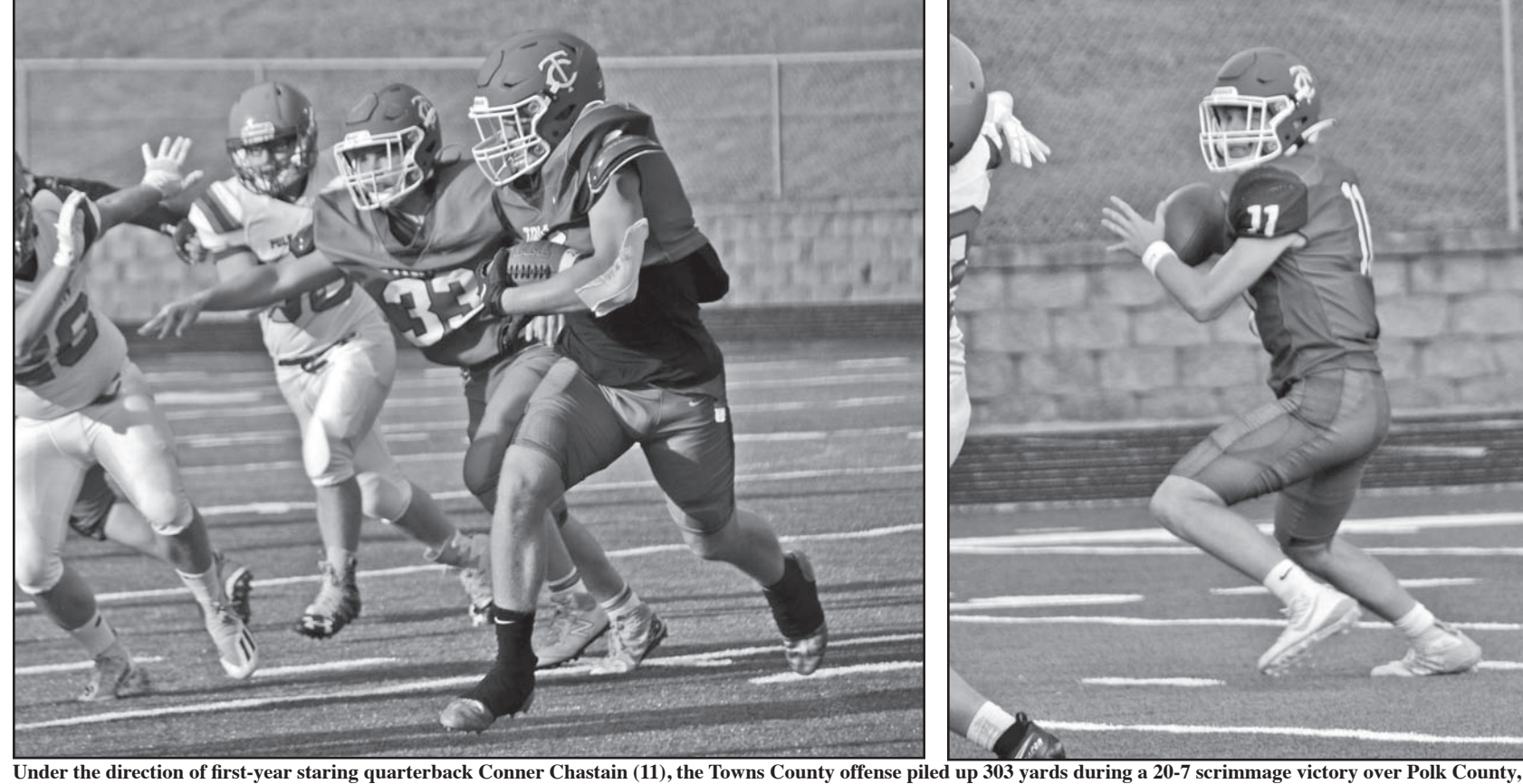
Tenn. on Thursday, Aug. 12.

As mentioned above, the Indians have a lot of depth this season, but most players are young and will therefore be required to learn via trial by fire, as they me be thrown into in-game situations and be expected to produce.