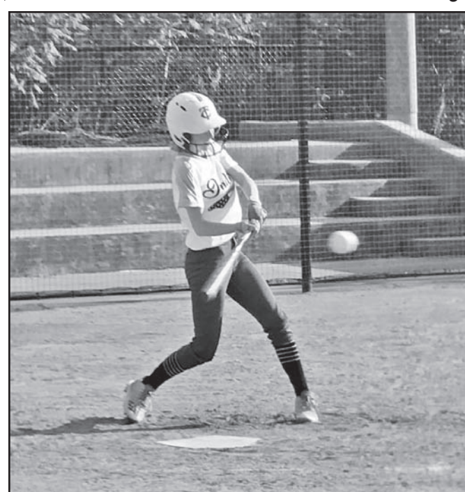
The Lady Indians suffered three 12-4 losses over the first two weeks but hope to right the ship this week at Rabun.

who is a senior this year. The Lady Indians will once more take to the road this week, traveling to Rabun County on Wednesday, Aug. 18, with a start time scheduled for 4:30 p.m.